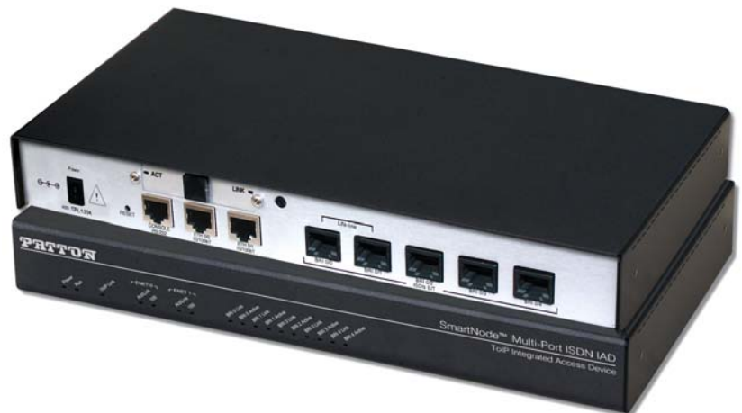
SmartNode 4650 with G.SHDSL.bis

Visit www.patton.com for more information.